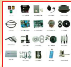
SPARE PARTS FOR PACKAGING MACHINES