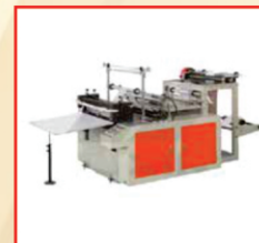
BOTTOM SEALING & CUTTING BAG MAKING MACHINE