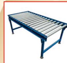
GRAVITY ROLLER CONVEYOR