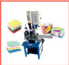
ULTRASONIC SPONGE SCRUBBER MAKING MACHINE