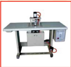
SINGLE LOOP HANDLE MACHINE