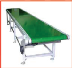
PVC BELT CONVEYOR