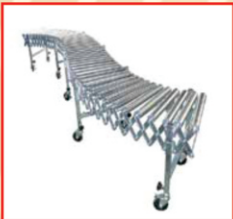
FLEXIBLE ROLLER CONVEYOR