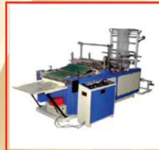
AUTOMATIC SIDE SEALING BAG MAKING MACHINE