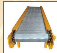
MODULAR SLAT CONVEYOR