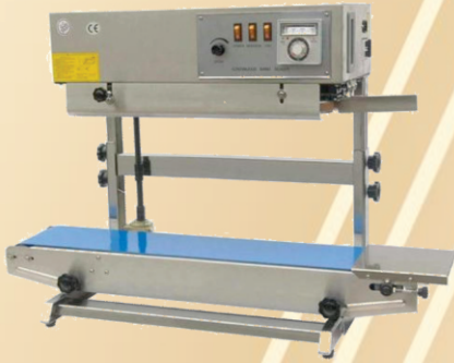
VERTICAL BAND SEALING MACHINE