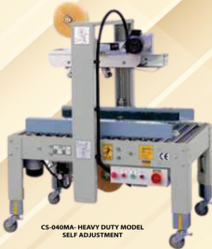
CS-040MA- HEAVY DUTY MODEL SELF ADJUSTMENT