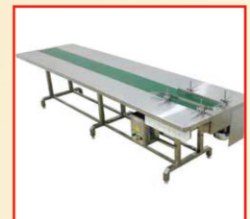
PACKING BELT CONVEYOR