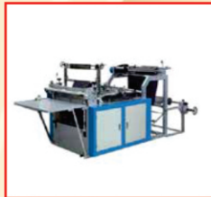
NON WOVEN ROLL TO SHEET CUTTING MACHINE