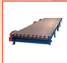
WIRE MESH CHAIN CONVEYOR