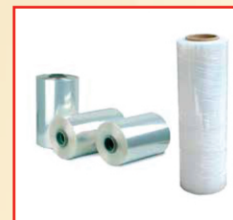
SHRINK & STRETCH FILM ROLLS