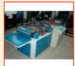
ZIP LOCK BAG MAKING MACHINE