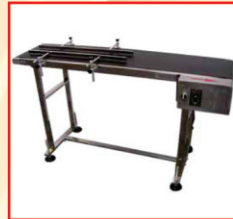
INKJET PRINTER CONVEYOR