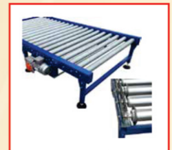
POWERISED ROLLER CONVEYOR