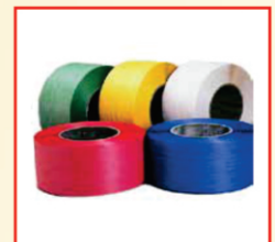
PP BOX STRAPPING ROLLS