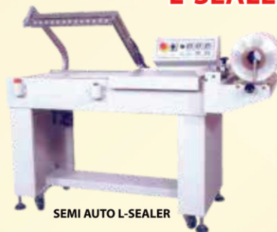
SEMI AUTO L-SEALER