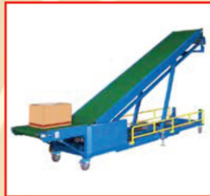
TRUCK LOADER CONVEYOR